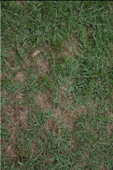
250 kg DM/ha/cm