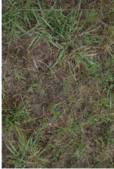
200 kg DM/ha/cm