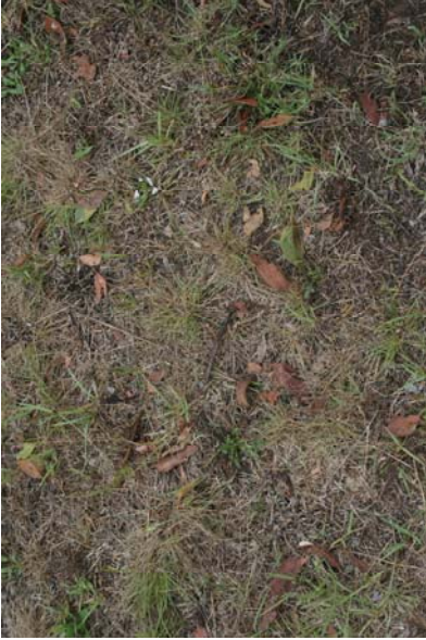
150 kg DM/ha/cm