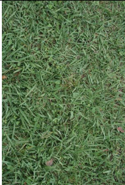
300 kg DM/ha/cm