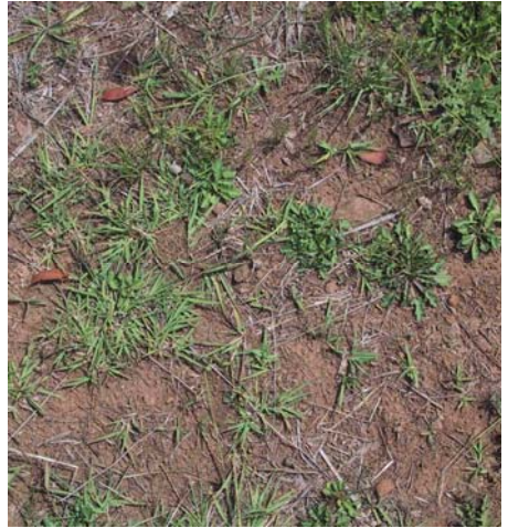
50% ground cover