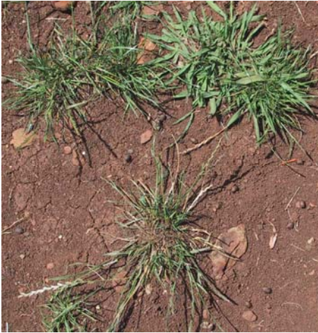
25% ground cover