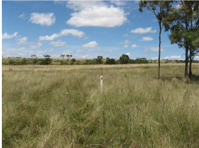
Queensland bluegrass ( Dicanthium sericeum ) pasture on basalt