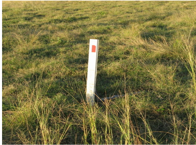
Pitted bluegrass and Couch pasture on clays and loams