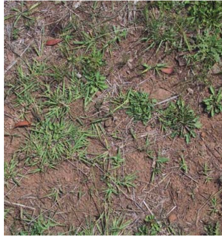
50% ground cover