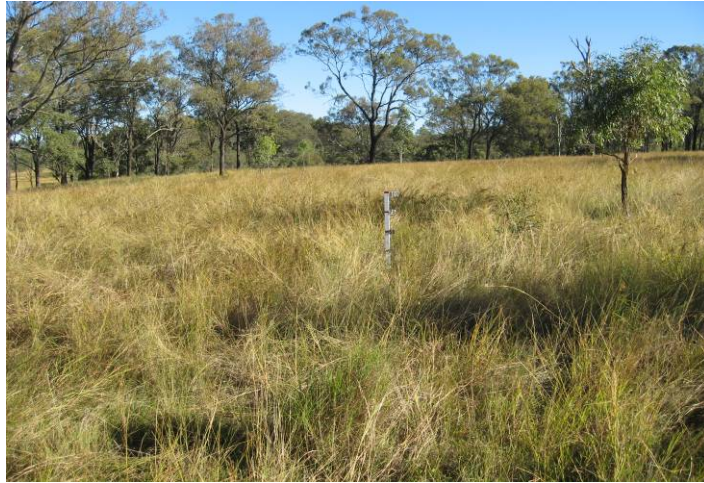
Kangaroo grass/ Black Spear grass Native pasture