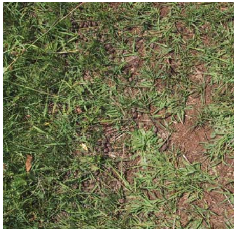
75% ground cover Pasture density = 200 kg DM/ha/cm