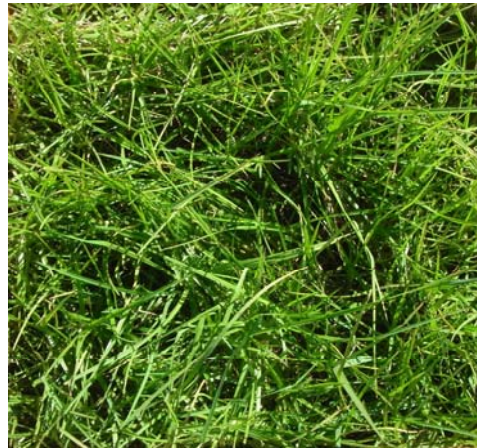
100% ground cover Pasture density = 300 kg DM/ha/cm