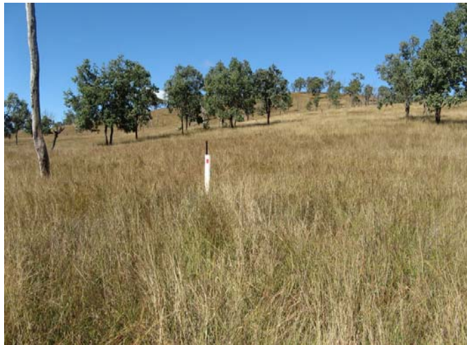
Speargrass / Forest bluegrass pasture on clays and loams